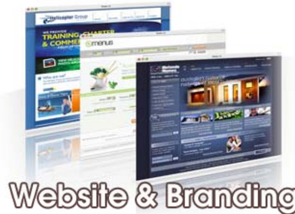
Website & Branding